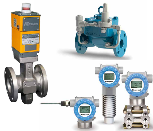
Fuel Train Components