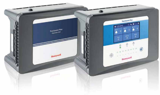
Touchpoint Plus Controller