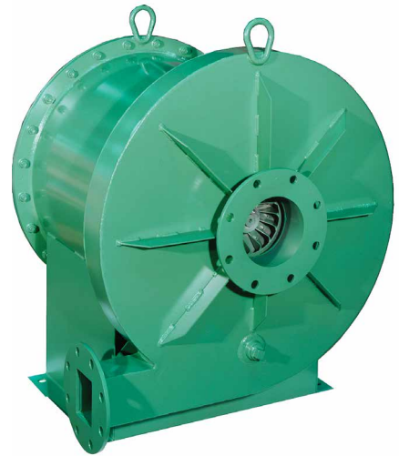
Eclipse HB Series Gas Booster